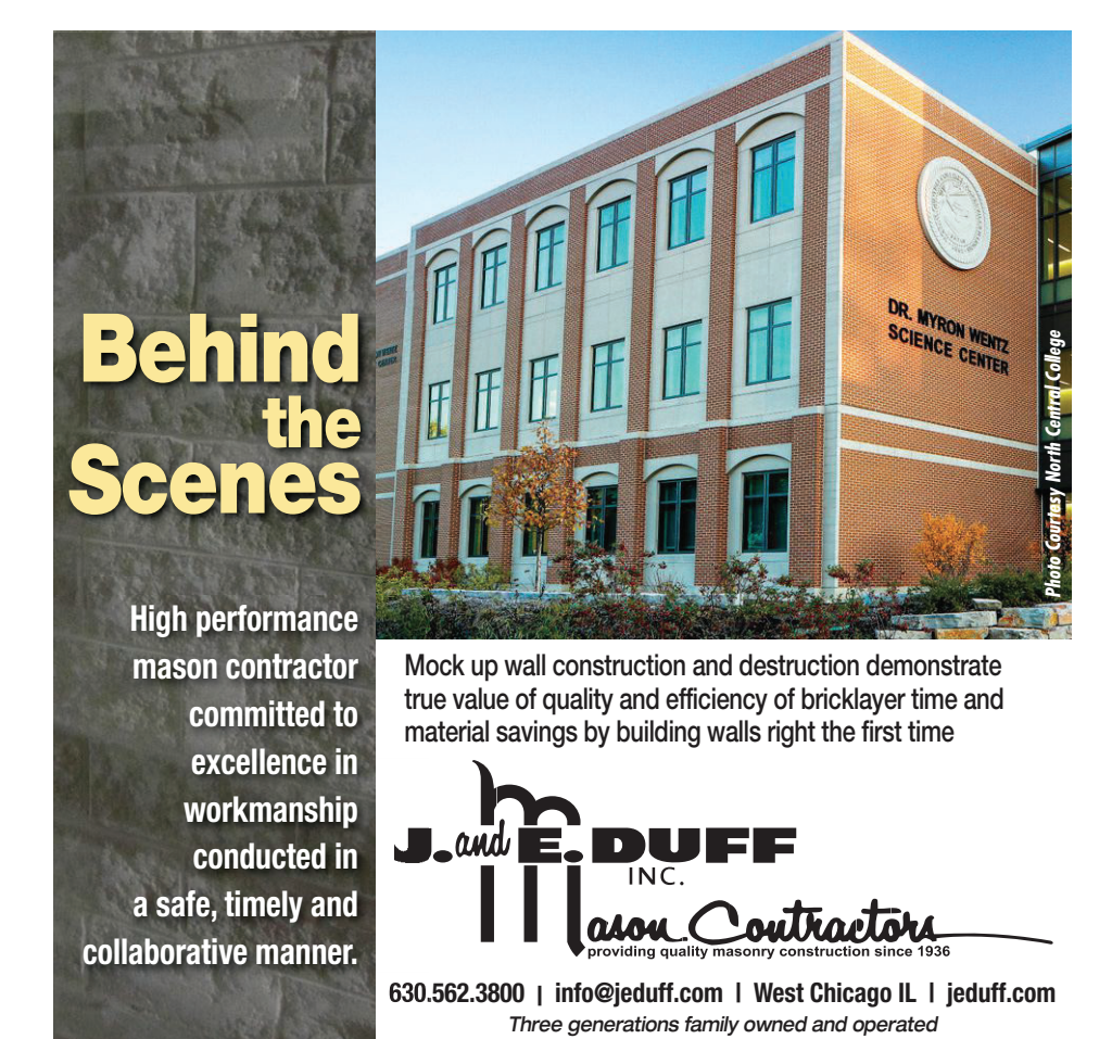
dynamics of masonry.com

czussman@pepperconstruction.com 847.620.4061